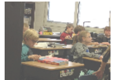
The fourth grade having class.