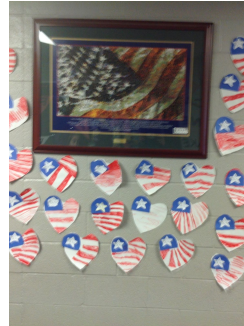
The kindergarten American flag hearts