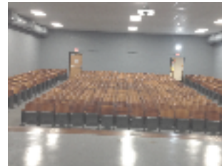
Operation Tiger pride