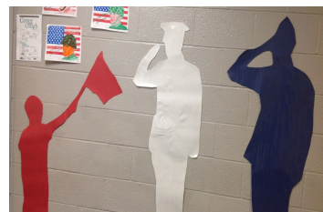
Silhouettes of soldiers